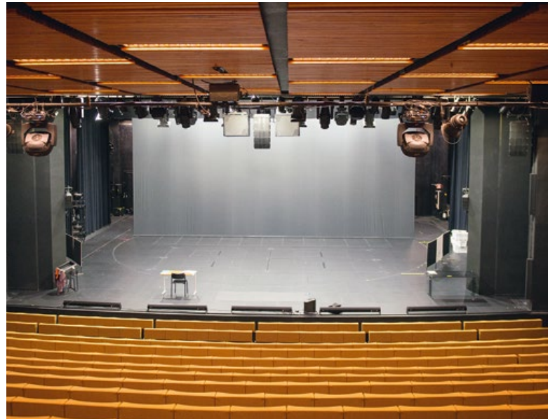
Based on a PC- and EtherCAT-based control platform, the City Theater in Kuopio accommodates flexible and independent control of the DMX environments, integrated light switches and buttons, and the ability to integrate third-party systems.

interfaces such as DMX, sACN, Modbus and more," explains Jussi Piispanen, before adding that "EtherCAT has several more advantages, such as flexible topologies and easy cabling, which provide significant cost benefits."