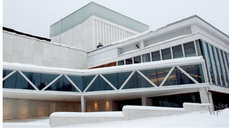
The City Theater in Kuopio, Finland. The building's old and new sections are connected by a kind of bridge that runs from the lobby in the old part along its facade to the auditorium in the new part while forming a protective canopy.

"The customer also wanted the ability to integrate additional components into the stage technology such as a fog machine, which exists in the DMX world. This requires a connection with the HVAC system so that the fog can be drawn in the right direction and the ventilation system adjusted accordingly. The serial KL6041 interface makes it possible. The communication between the central controller and the fog machine and the HVAC system runs over Modbus. This makes EtherCAT the powerful backbone, which covers all important