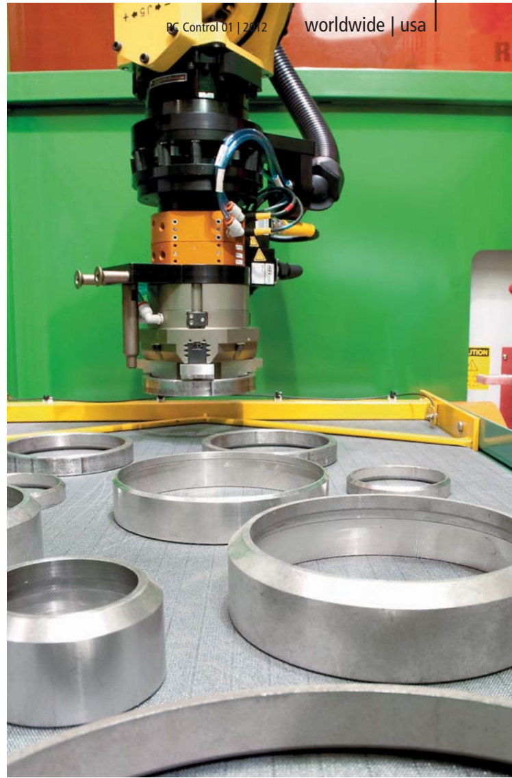
The robot picks up an end ring from an infeed conveyor.