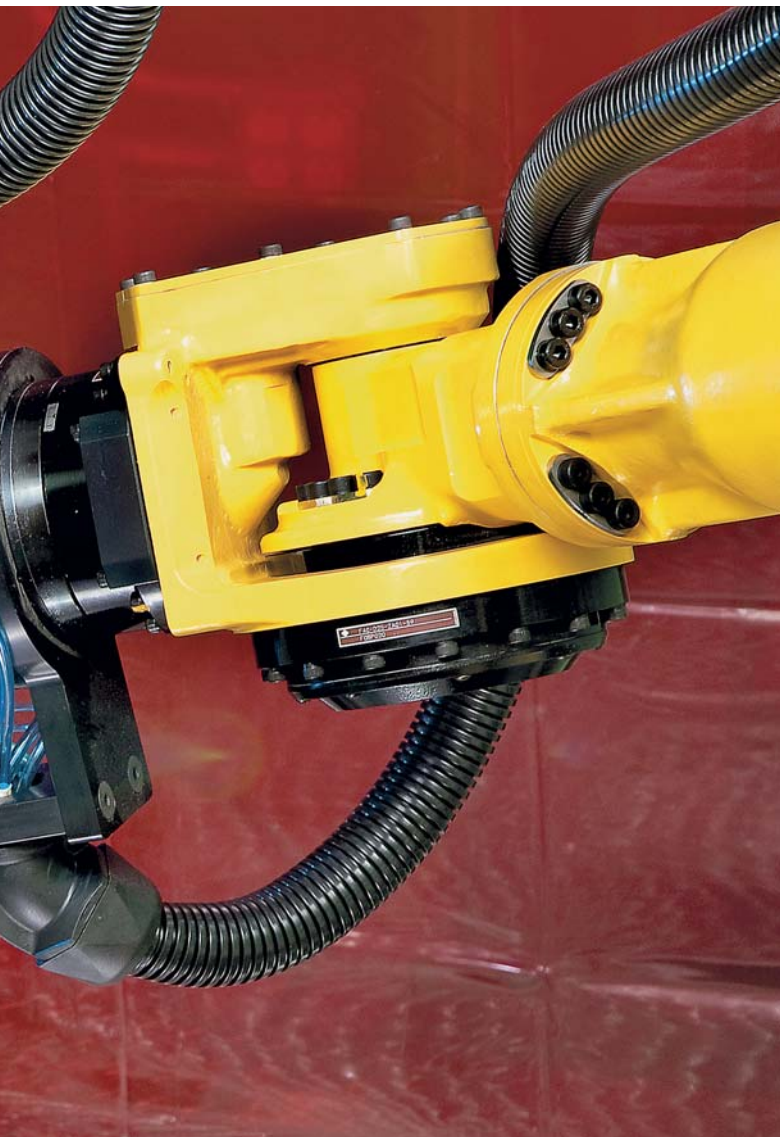
The robot welds the end ring to the cylinder.