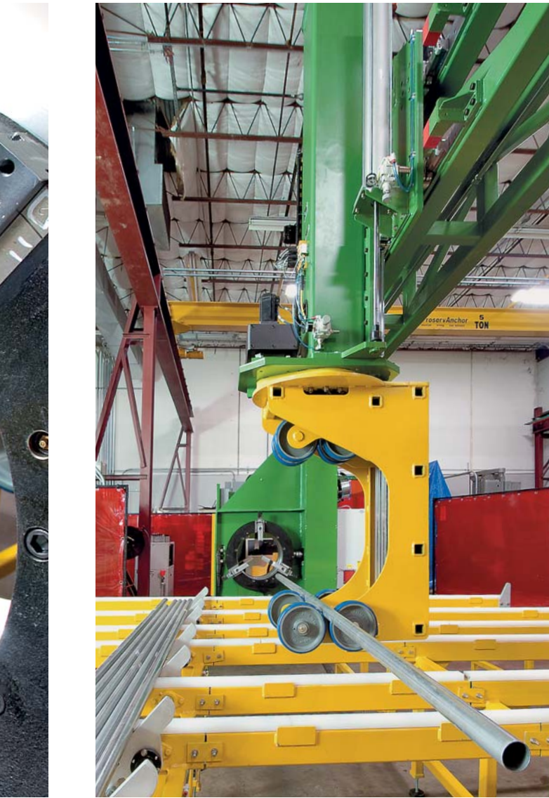
The cut-to-length cylinder (121 to 304 cm in length and 4 to 20 inches in diameter) is picked up by an overhead gantry crane and placed into the servo-actuated fixturing jaws.

a 30% increase in production throughput compared to manual assembly due to the fully automated fixturing. "Only the loading and unloading of the work pieces still takes place manually", John Martin stresses. "In addition, by using EtherCAT, we save approximately one hour per axis in wiring time on account of the simple topology. Fewer components and more compact designs also permit the use of smaller control cabinets."